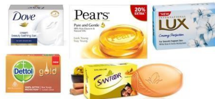
Best Soap Brands In India